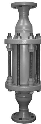
Table AB - Inlet & Outlet Size