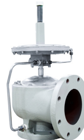
Table A - Material & Flange