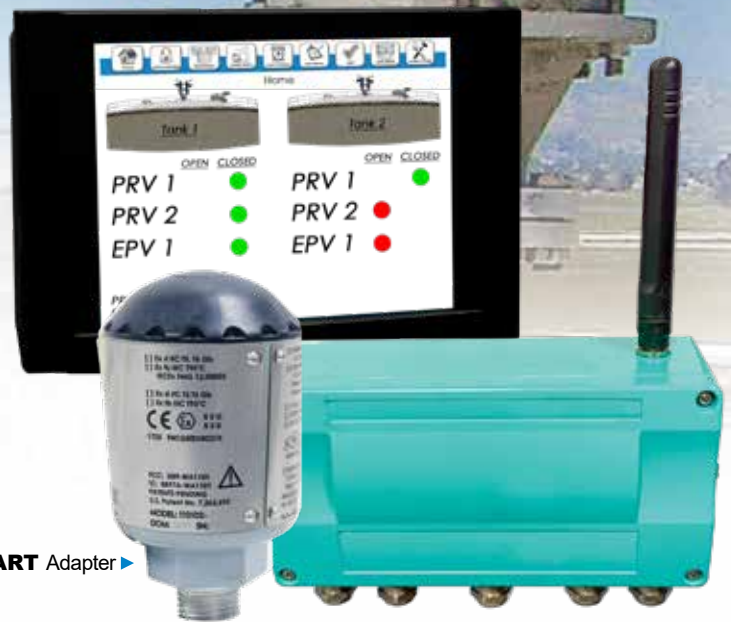
WirelessHART Adapter ▶