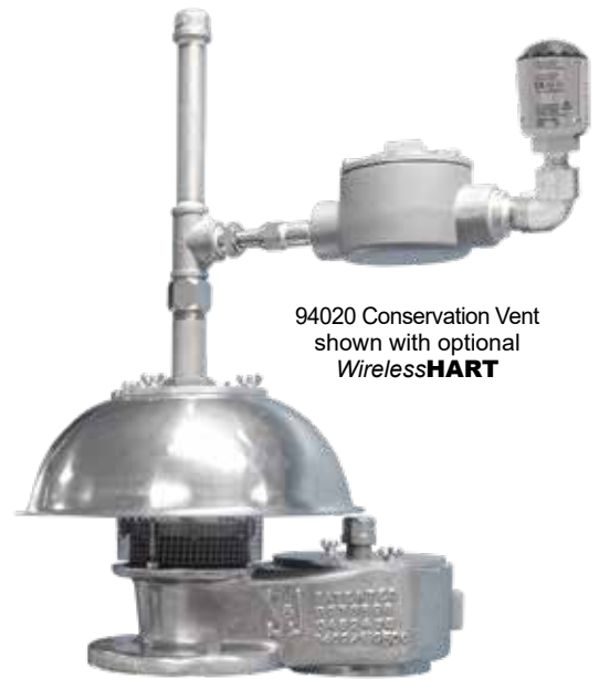
94020 Conservation Vent shown with optional WirelessHART