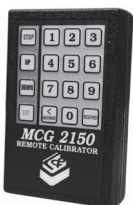
MCG 2150 Handheld Infrared Calibrator