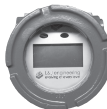
MCG 1350M Ground Level Display