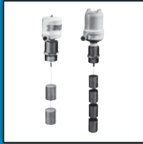
Liquid Level Switches