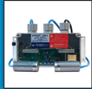
Point/Multi-Point Level Controls & Continuous Level Sensors