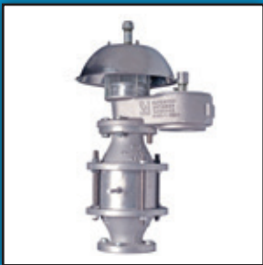
Tank Vents, Flame and Detonation Arresters, Fittings & FRP Equipment