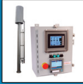
Digester Gas Equipment Waste Gas Burners