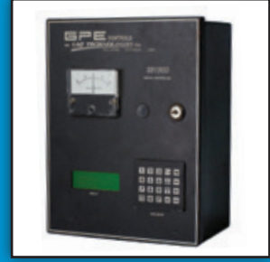
Mold Level & Strip Guiding Measurement & Control Systems for Metals/Steel Industries