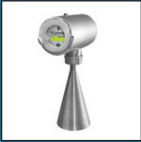
Liquid Level Gauging, Temperature Detection & Inventory Management