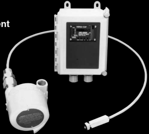
Versa-Cap 460 (Remote)