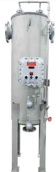
Option E = 6