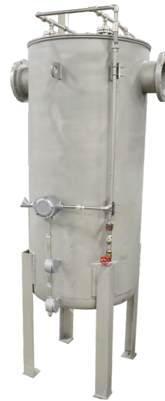
Option E = 4

To maintain safety and protect against releasing biogas from the separator's drain, there are high and low liquid level switches incorporated in the design. It is important for the water level in the tank to be maintained so that biogas does not exit the drain. A low level dry contact is used to alert operators that the water level in the tank is below its allowable operating condition. By using a solenoid valve, the high level switch is used to turn off the water supply to the sprayers to keep the tank from overflowing. Valves on both the spraying system and drain line should be used to adjust the fill and drain rate of the tank. The fill and drain rate should be calibrated to maintain a water level between the high and low level switches during normal operation. That way, high liquid level scenarios are kept to a minimum and the spray system is kept on.