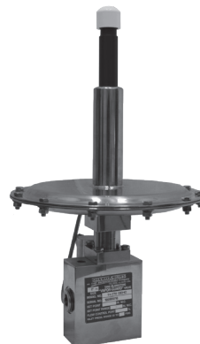
Table A - Connection