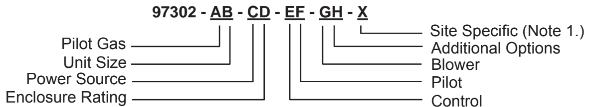
TABLE (A) PILOT GAS