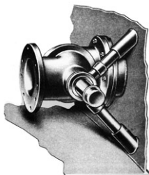
TABLE III - (EF) SWING JOINTS (125# F.F. FLANGE)