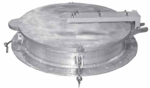
TABLE I - (AB) SIZE & MATERIAL