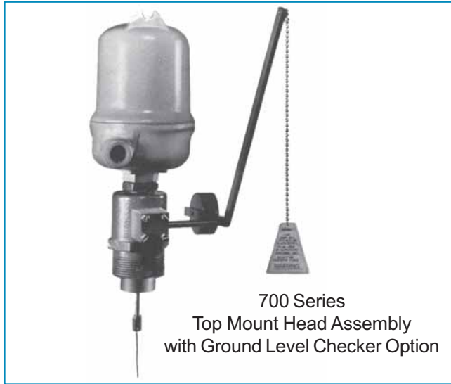
700 Series Top Mount Head Assembly with Ground Level Checker Option

Checks operation of tank safety switches